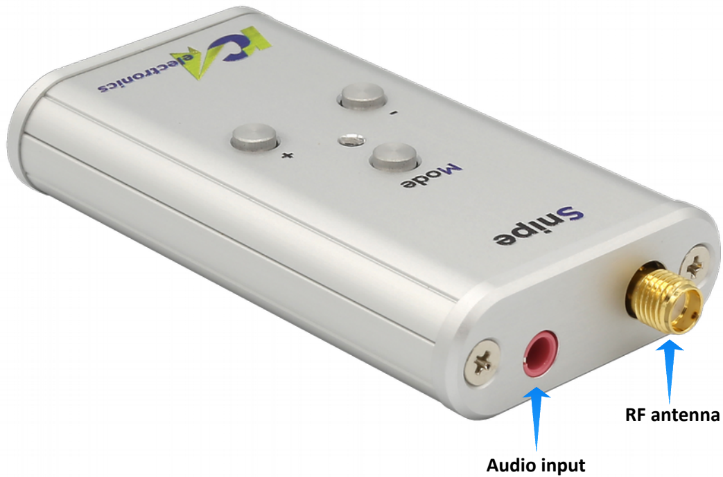
Figure 2: The Snipe module.