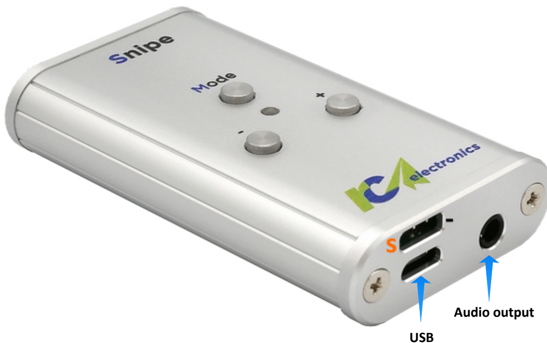
Figure 1: The Snipe module.

Important: Be careful on polarity when connecting 3 rd party telemetry cable to the unit. Improper connection can damage unit!