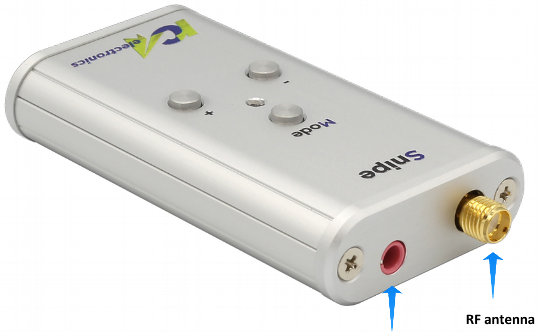
Figure 2: The Snipe module.